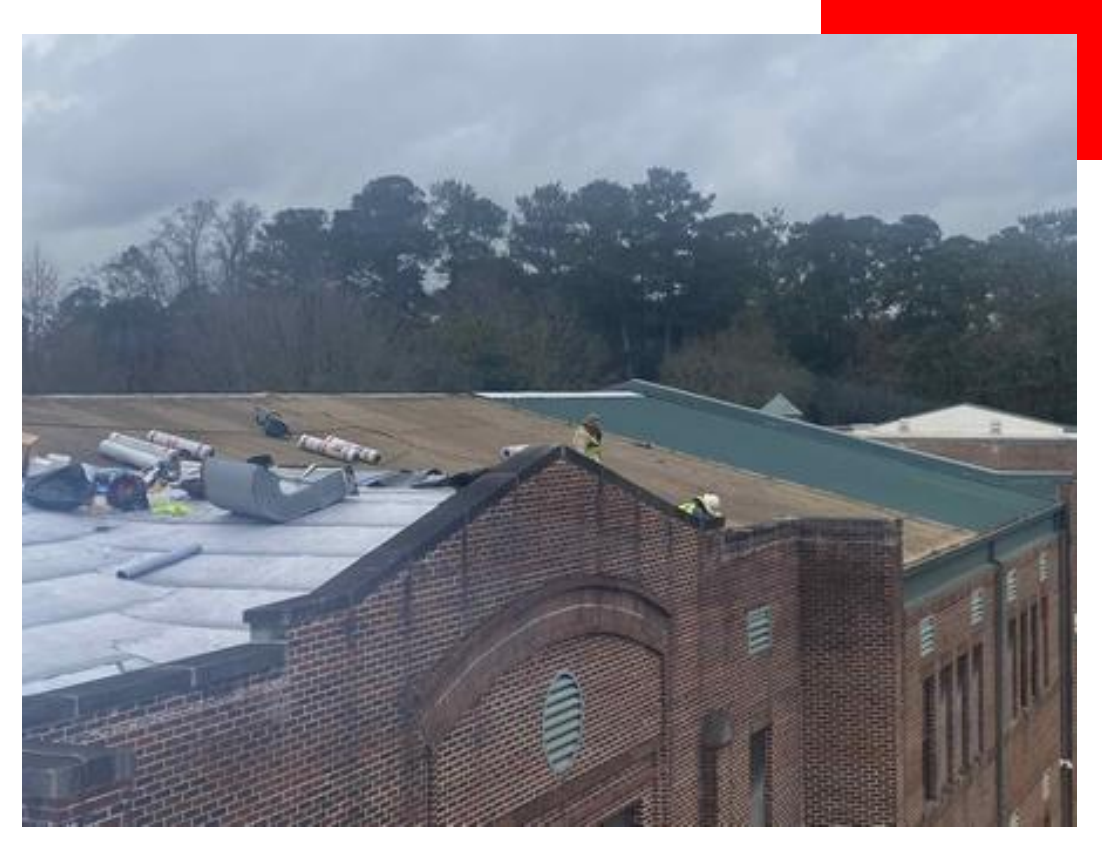
Metal roof replacement