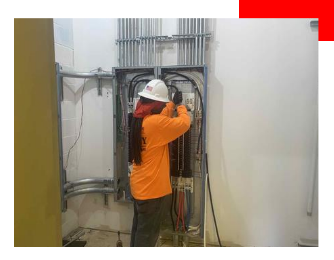
Low voltage wire installation